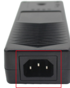
Mains input terminal 100-240V~ 50/60Hz DC output:12V, 4 channels total power 60W