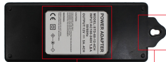
OEM LOGO and rating Label

Fixed wall hole The power supply supports desktop applications and wall-mounted applications