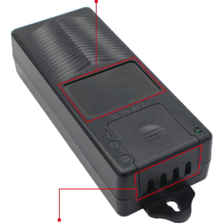
Channel installation wiring hole